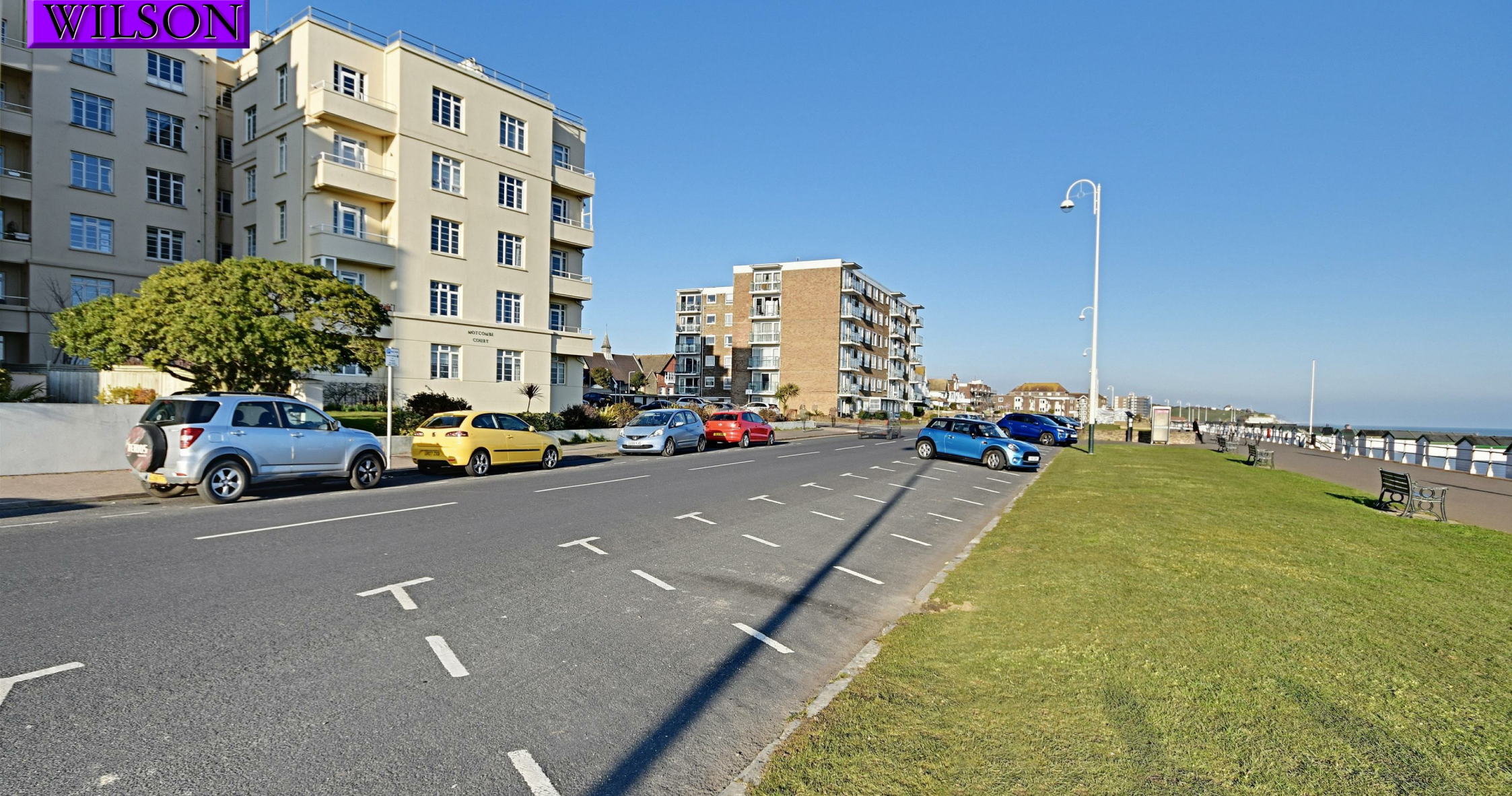
2 Motcombe Court Bedford Avenue, Bexhill-On-Sea, East Sussex TN40 1NQ £249,950